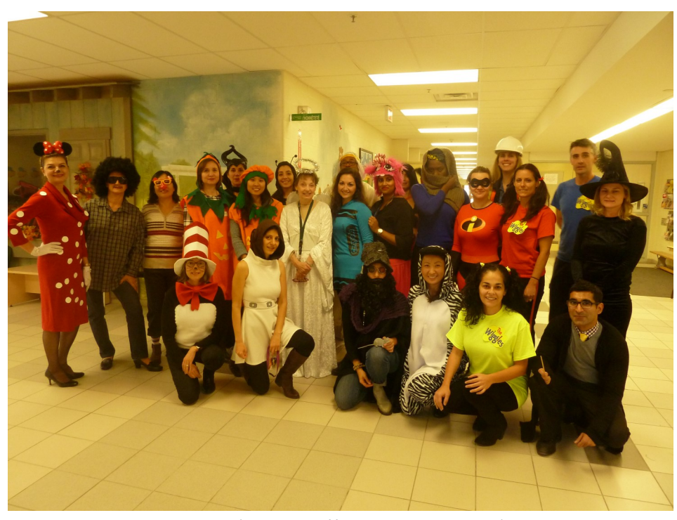
MJPS has Halloween Spirit!